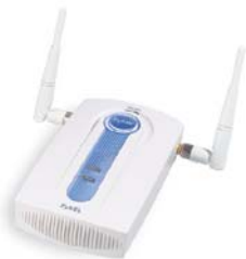
802.11g Wireless AP with WDS